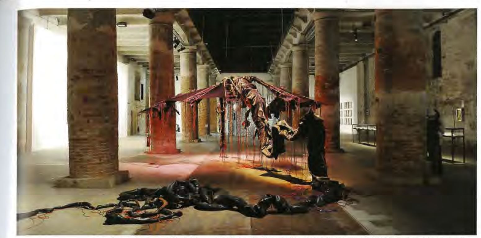
Nicholas Hlobo, limundulu Zonke Ziyandilandela, 2011, suspended sculpture of rubber, ribbon and mixed media, installation view.

Christian Boltanski filled the French Pavilion with a welter of scaffold towers arranged as one would imagine the inside of a huge printing press would look- cogs, motors, rollers, paper guides. Whirling around at frantic speed is a thirty-centimetre wide strip of film showing infants' faces. In an antechamber a projector beams an ever-changing kaleidoscope of sixty Polish "new born" and fifty-two "dead Swiss" faces. These have been cut into three, and run separately from one another so that the faces are incomplete. Your job as viewer is to try and stop the display so that the three sections cohere into a single visage. If you manage this (there is a button to help you), music plays and you win the work. A whole million-Euro Boltanski to take home with you. One can also play this game of chance on line, for one minute a day. Simply go to www.boltanski-chance.com and try your luck.